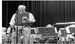
Iowa Western Band