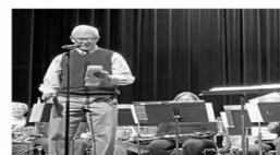
Iowa Western Band